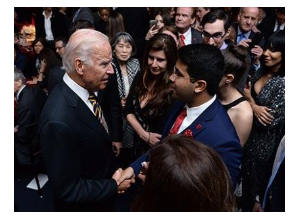
Surrounded by SBU students and other

Watch the video screened at the 2017 Stars of Stony Brook Gala: The Future is Now